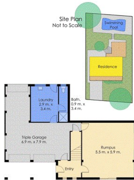
Lower Floor Plan