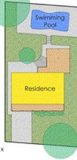
Site Plan Not to Scale