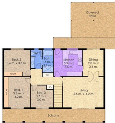
Upper Floor Plan Approx. Internal Floor Area: 200 sqm.